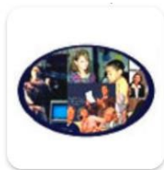
Virtual Counselor (Report Cards)

Virtual Counselor (Report Cards) To view student grades click the Student Info drop down menu